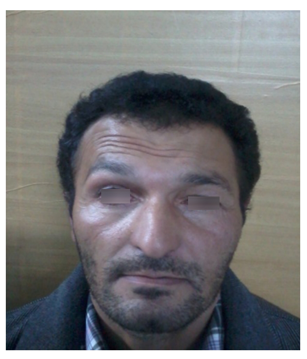
Figure 4. 1.5 years After Surgery

However, damage to the facial nerve branches following laceration is also common.