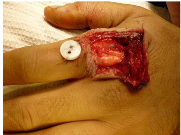
Figure 2. Intraoperative Photography of Roll Stitch Suture

interrupted suturing technique. The study was approved by our institution review board, and all patients gave informed consent to be included in the study. This study had ethical approval.