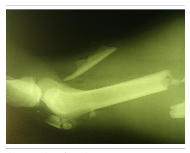
Figure 2. Lateral View of Femoral Segment

The radiographic findings were as follows: