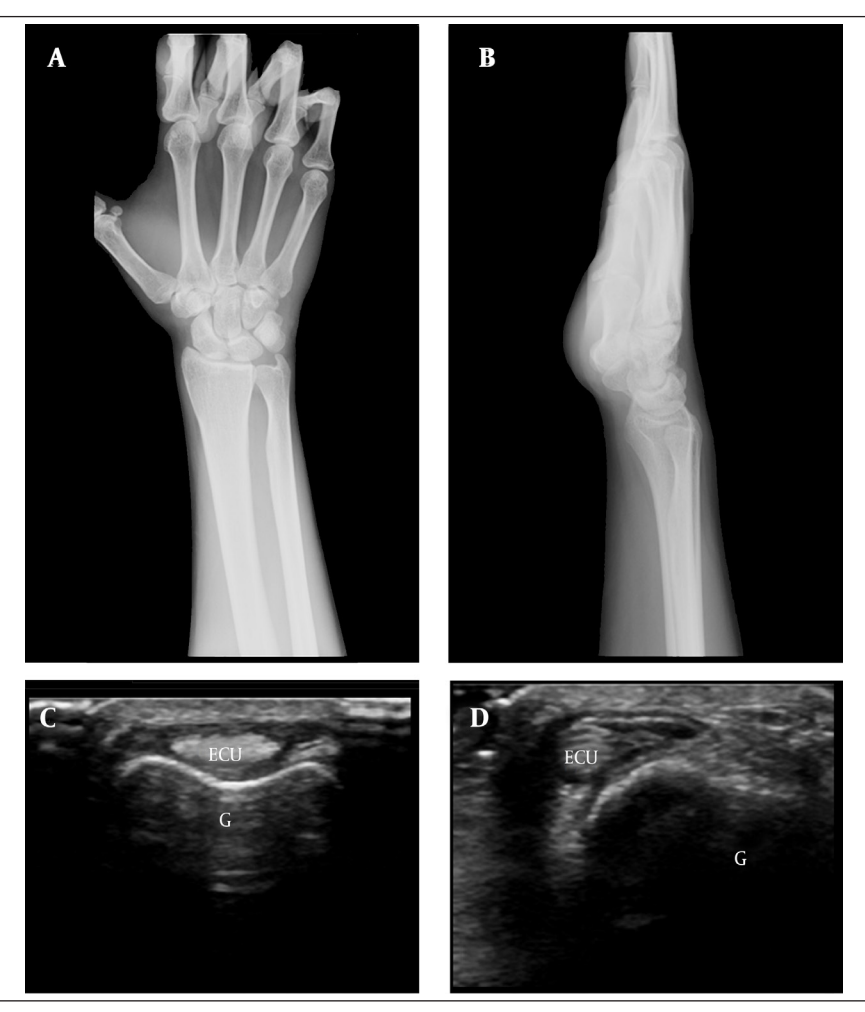
Figure 1. A) Anteroposterior; B) Lateral plain radiograph of the patient's right wrist demonstrating no pathology; C) Transversal U/S scan at the level of ECU tendon's groove with the forearm in pronation. The ECU tendon is lying in its groove (normal position); D) With the forearm in supination the ECU tendon is dislocated volarly, at the ulnar side of its groove.

All procedures concerning the management of the patient were in accordance with the Helsinki Declaration of 1975, as revised in 1983.