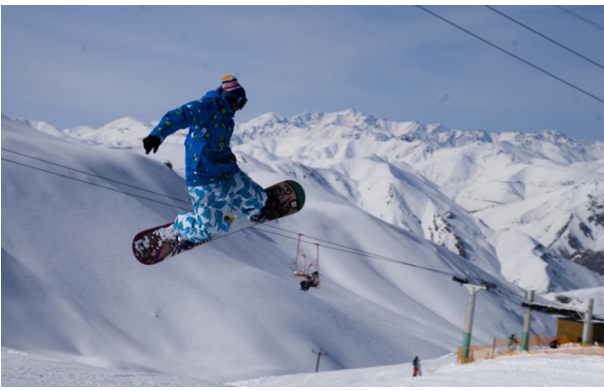
Figure 6. Snowboarding at Dizin