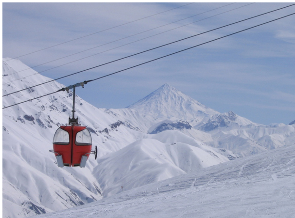
Figure 4. View of the Damavand Volcano From Dizin