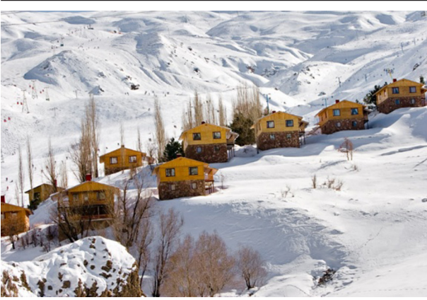
Figure 5. View of the Cabins at Dizin