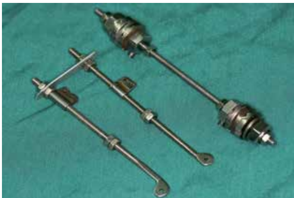
Figure 2. Ilizarov Original Device and our Device Depicted Together; the Assembled Ilizarov Device Weighs 32.5 Grams and our Assembled Device Weighs 6.5 Grams