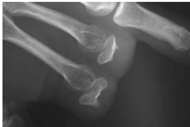
Figure 6. The X Ray of the Remaining Phalanges