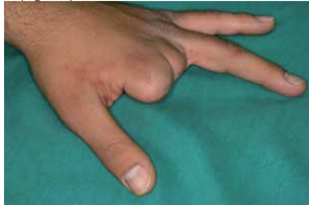
Figure 5. The Hand in Dorsal View

small two holes plate at the osteotomy site in order to get more anchorage for distraction. The distraction was successful and a length of 24 mm was achieved which was bone grafted at the second stage ( Figures 7 and 8 ). The graft healed but with some volar bending of the proximal bones. After a web deepening procedure with skin graft he was able to wear the finger prostheses he had requested ( Figure 9 ).