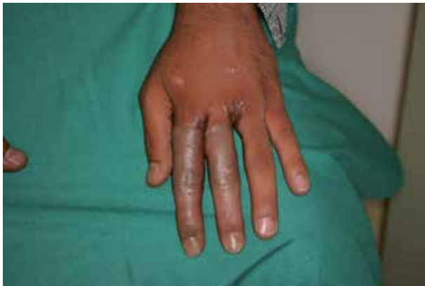
Figure 9. The Patient with Finger Prostheses in Place