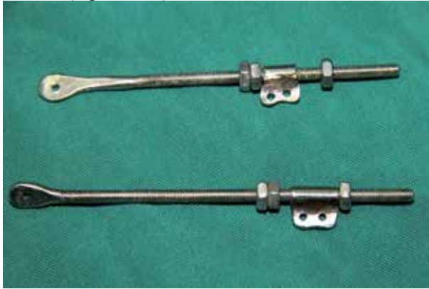
Figure 1. The Rods Can be of Differing Lengths for Fingers or in Children who Have Smaller Phalanges

fold and the distracting device is mounted over these rods. In our device the rods are long screws with an "eye" at one end and the sliding sleeve with two "eyes" for the pins which will distract the bone and these sleeves slide over the rods by tightening the bolts behind the sleeve on the rods (Figures 1 - 3).