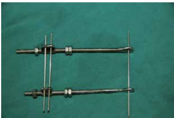
Figure 3. The Assembled Device is Depicted; the Distal Two Pins Transport the Bone Distally

Between 2007 and 2012, we carried out distraction callosities on 45 digits in 32 patients. In order to consider the factors which influenced the period of healing, we excluded children from the study. These left 26 digits in 18 patients. There were 14 men and four women, with a mean age of 39 years (18 to 62). All the digits had had traumatic amputation. Assembling of the distractor is very simple and consists of insertion of one proximal pin at the most proximal part of the bone to be distracted or sometimes in the metacarpal proximal to the bone to be distracted and two parallel pins at the distal part of the bone to be distracted. For the metacarpal distraction one pin is inserted longitudinally in the distal part of bone to be distracted and the proximal part of pin is bent as a hook which will grasp the bone and exert traction.