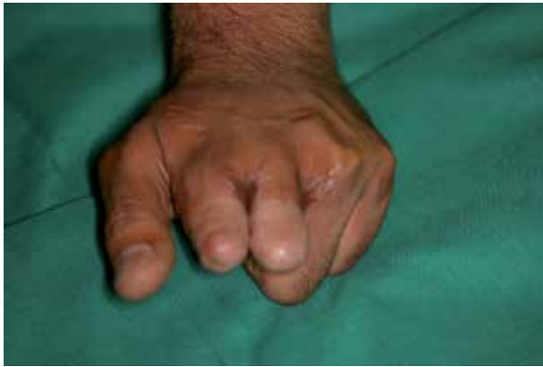
Figure 8. The Bone Graft and Web Deepening Procedure has been done