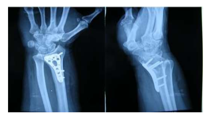
Figure 3: Showing anterior-posterior and lateral radiographs at six months post-surgery.