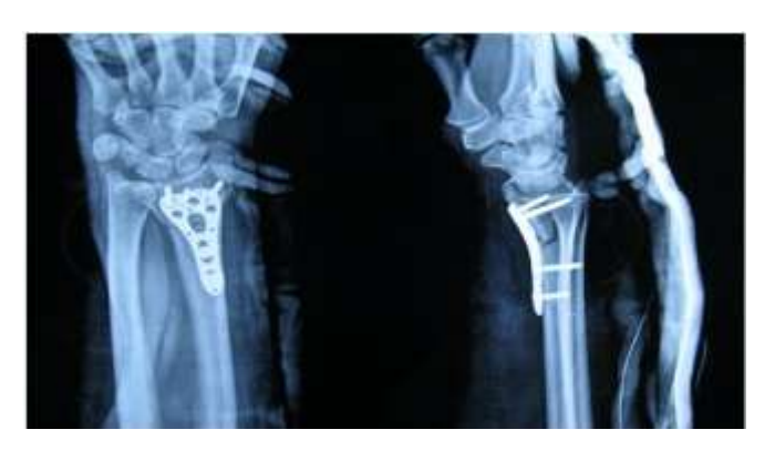
Figure 2: Showing immediately post-operatively anterior-posterior and lateral radiographs

10.6±1.76 weeks ranging from 8 to 16 weeks. Patients were assessed clinically at two weeks, six weeks, three months, and at six months of final follow-up time, and the observations are presented Table 2. Radiological parameters were in calculated from the x-rays postoperatively and after six months of the last follow-up as outlined in Table 3. Functional assessment was done using the modified Gartland and Werley scoring system at final follow-up and presented in table 4. Out of the 28 patients, 21 of them had excellent outcomes, four good, two fair, and one poor, according to the Gartland and Werley scoring system. Three patients reported complications, one of them had screwed impingement which removal of the screw was done eight months after surgery. One patient developed a superficial wound infection which was managed by oral antibiotics (cefuroxime 500 mg) for one week as regular dressings, and another one developed chronic regional pain syndrome (CRPS) that was managed conservatively; however, the patient developed severe restriction of movement in hand and wrist and ultimately had a poor outcome. None of the patients developed union, malunion, implant failure, or tendon rupture in our study.