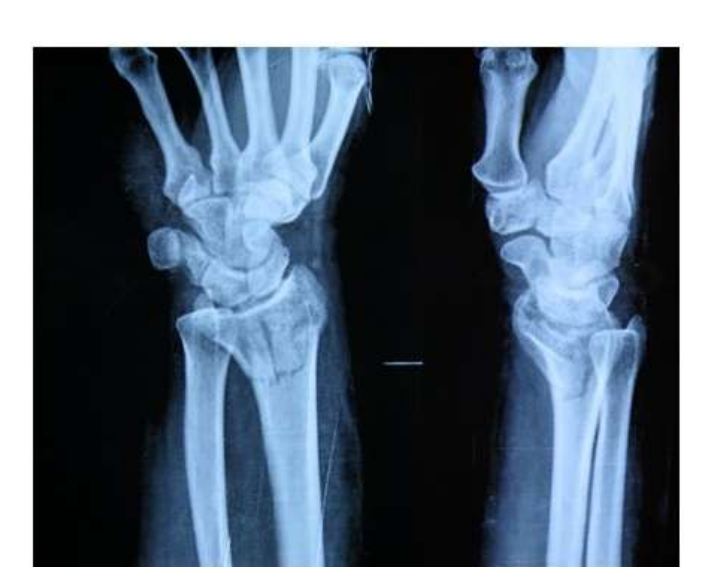
Figure 1: Showing pre-operative anterior-posterior and lateral radiographs of wrist.