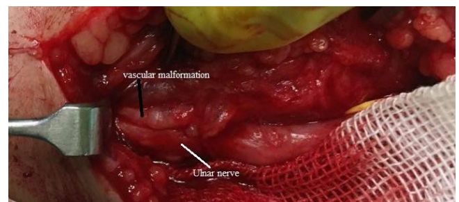
Figure-2. Mass next to ulnar nerve