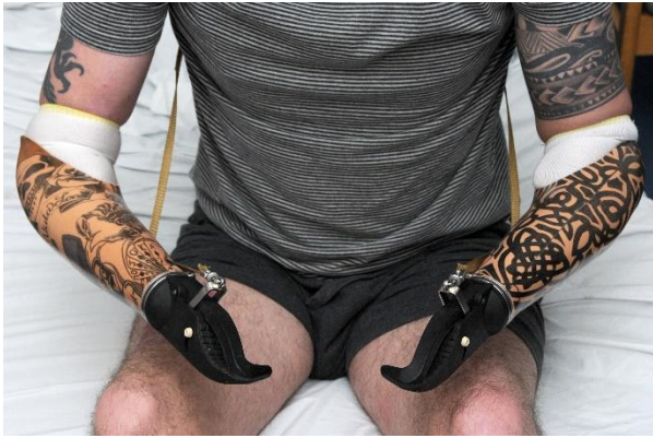
Figure-3. Bilateral below-elbow prosthetic limbs