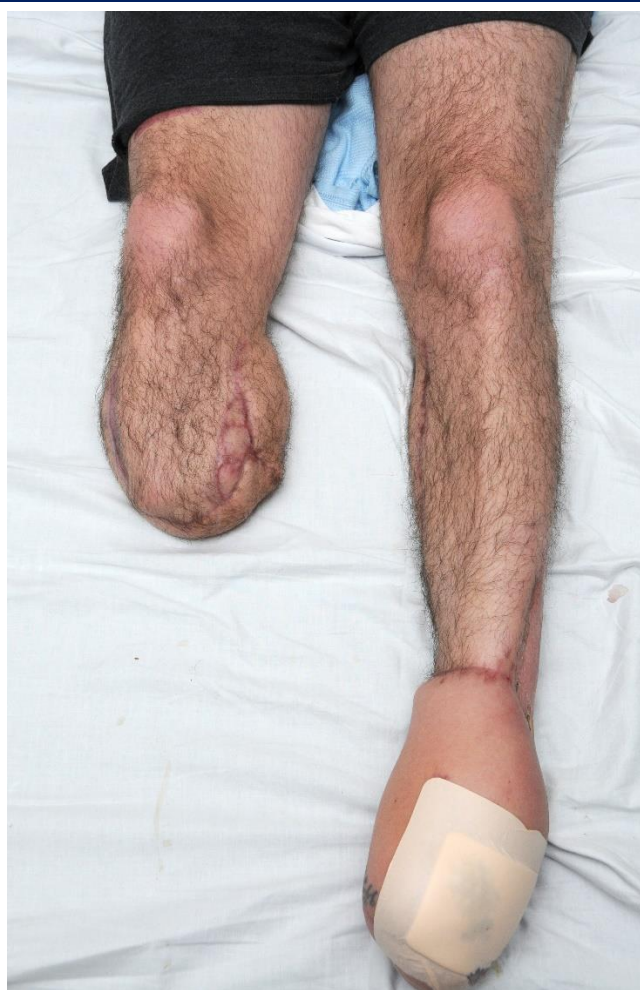
Figure-2. Right transtibial amputation and left midfoot amputation with infected wound (dressed)

On presentation to the Oxford Centre for Enablement, pain assessments using the numeric pain scale indicated that limb pain would be a significant barrier to optimal rehabilitation.