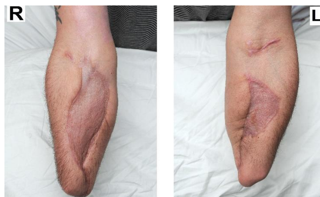
Figure-1. Bilateral transradial amputations

underwent bilateral trans-radial, a right trans-tibial amputation and left midfoot amputation requiring chimeric partial scapula and latissimus dorsi muscle flaps, short perforator-based skin flaps and split skin grafts (Figures-1, Figure-2). The patient was otherwise previously fit and well, married with children and was a roofer by trade.