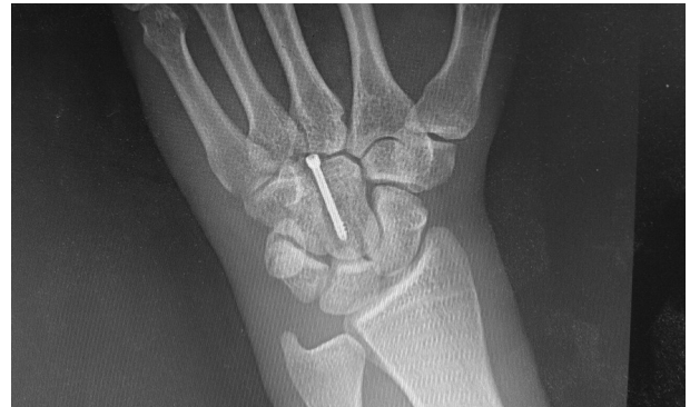
Figure 4. Postoperative Wrist Radiography in Anteroposterior (AP) View