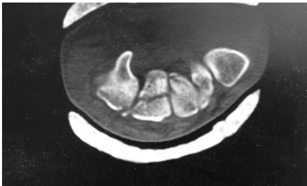
Figure 2. Preoperative Wrist CTs in Axial View