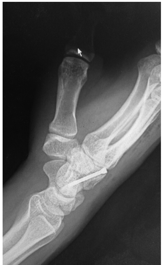
Figure 5. Postoperative Wrist Radiography in Lateral View

the fourth metacarpal bones the hamate, the lunate, the scaphoid, and the trapezoid and it is also protected from fractures because of its cuboidal morphology (6). Due to the intercarpal ligaments, most of its fractures remain dislocated (9). Isolated capitate fracture may be misdiagnosed because of the lack of clinical symptoms and its