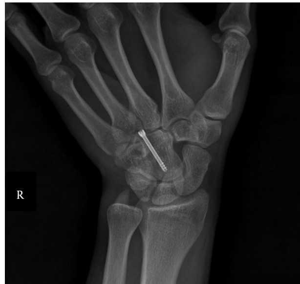
Figure 7. Wrist Radiography in Scaphoid View (After 3 Months of the Surgery)

ambiguous radiographs. Bone scan (10), CT scan (11), and MRI (9) have been recommended for these occult fractures. Johnson (12) reported that the lunate's posterior margin causes 'beheading' of the capitate, but with significant traumas with wrist hyperextension (1, 8). However, even minor repetitive traumas are believed to create bone damage by devascularization (4, 5, 13). Because of its primary vague symptoms, a delay in diagnosis frequently leads to non-union, avascular necrosis, and posttraumatic arthritis (5, 8, 13). In displaced fracture of the capitate, it is necessary to do anatomical reduction and internal fixation with headless compression screw (HCS) (2). The HCS is superior to the K-wire because of its compression to the site of the fracture, which permits an early range of motion. Immobilization is essential until the signs of fracture healing are evident. The most frequent complication is non-union: 19.6% to 56% in isolated capitate fractures (5, 14). Non-union is mostly the consequence of delayed diagnosis and paucity of primary sufficient treatment. A long-term possibility of midcarpal arthritis after isolated capitate fracture is controversial (14). In particular, because of the capitates' blood supply, we should consider vascular complications (4): the proximal fractures have greater possibility for necrosis (5, 13).