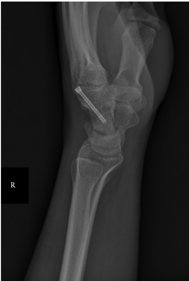
Figure 6. Wrist Radiography in Lateral View (After 3 Months of the Surgery)