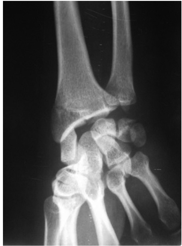
Figure 2. Transradial Styloid Perilunate Fracture-Dislocation

A 30-year-old male with severe wrist pain, which was a result of a motorcycle accident, referred to Emam-Reza general hospital, Mashhad, Iran. On posteroanterior and lateral radiographs of the wrist, it was found out that the wrist had been dislocated as in a case of transradial styloid perilunate fracture-dislocation ( Figures 1 and 2 ). During the operation, under fluoroscopic control, closed reduction was tried. The reduction was so perfect that it was decided to stabilize it with percutaneous multiple pin fixation. Afterwards, no distance was observed between the fractured dislocated parts. The procedure was finalized using a long arm cast. Postoperative radiographs are illustrated in Figure 3 . The cast was removed after 2 months. After 2 years of follow-up, the patient was symptom-free with a satisfactory ROM (flexion: 30°; dorsiflexion: 40°).