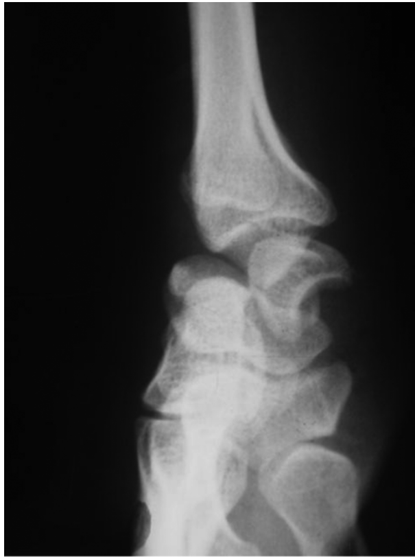
Figure 1. Wrist Radiographs

not complain of loss of grip or other difficulties in daily activities.