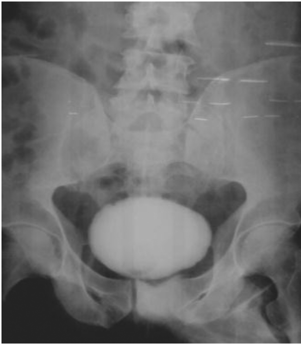
Figure 3. Retrograde Cystogram, Two Weeks After Trauma, at the Time of Discharge, No Leakage of Contrast Media from the Urinary Bladder was Observed

a transurethral catheter and/or a suprapubic catheter (5, 7, 8, 13). Although previous reports described successful conservative management of intraperitoneal bladder rupture cases, they were all cases with iatrogenic injuries (2). However, since a blunt traumatic intraperitoneal bladder rupture usually includes extensive lacerations (4), non-operative management is attempted in few cases according to the literature review.