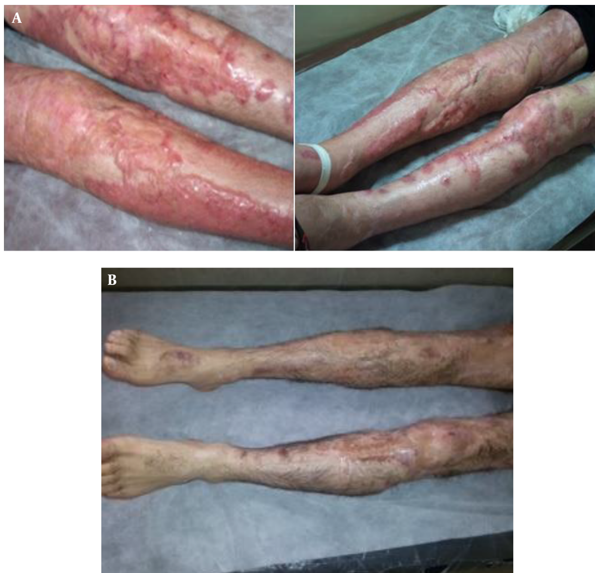
Figure 5. The Patient's Wounds Gradually Healed; A, Early on After the Wound Healing Process Started and B, After Near Two Years, Scar Tissue Covered the Lower Limbs