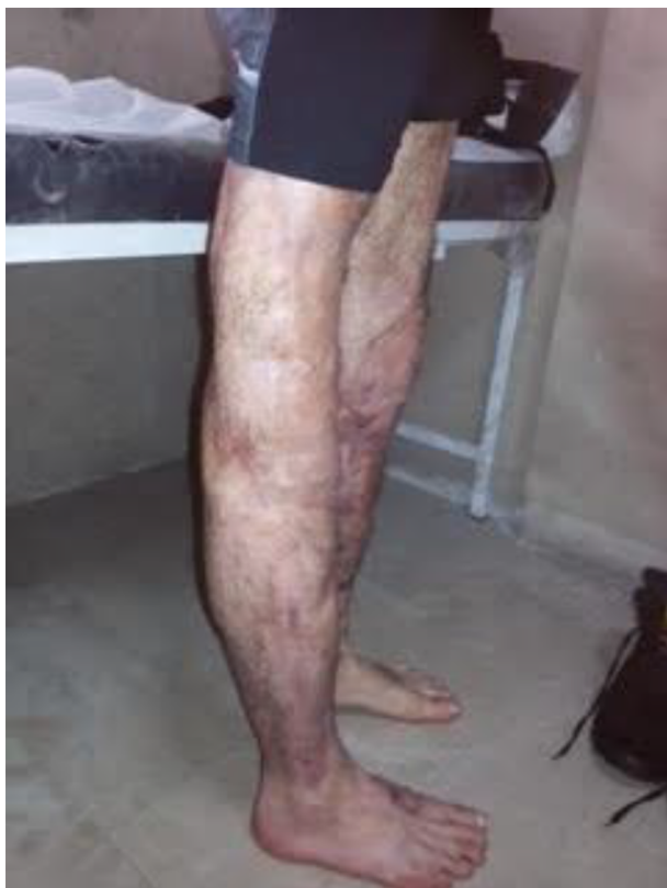
Figure 6. At the Final Visit, the Patient Suffered From Genu Recurvatum and Varus Instability During Weight Bearing