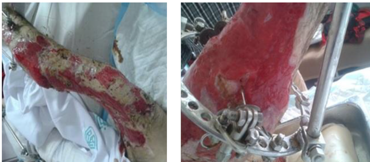
Figure 1. The Patient's Wounds, Which Gradually Spread Across Most of the Lower extremity