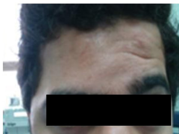
Figure 1. Preoperative Right Forehead