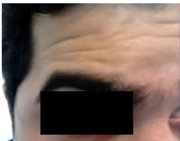
Figure 4. Postoperative View of the Right Forehead