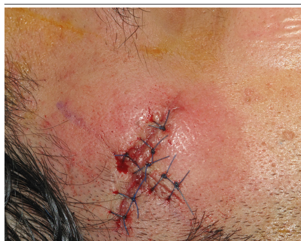
Figure 3. Wound Closure After Anastomosis