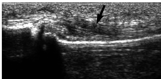
Figure 1. Longitudinal ultrasound image of a flexor tendon reveals an area of focal decrease in tendon echogenicity (arrow) that suggests partial tear

analyze the data, t -student test was performed and Kappa coefficient was measured, using SPSS V. 20 and Statistica V. 10. P values of less than 5% were considered statistically significant.